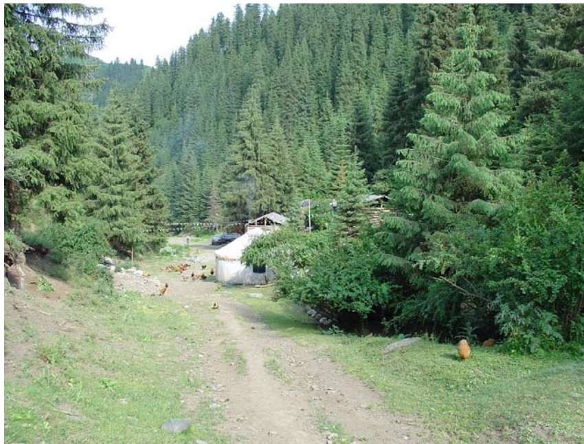
FIGURE 5 Montane larch forest in Barkol in the easternmost Tianshan Mountains