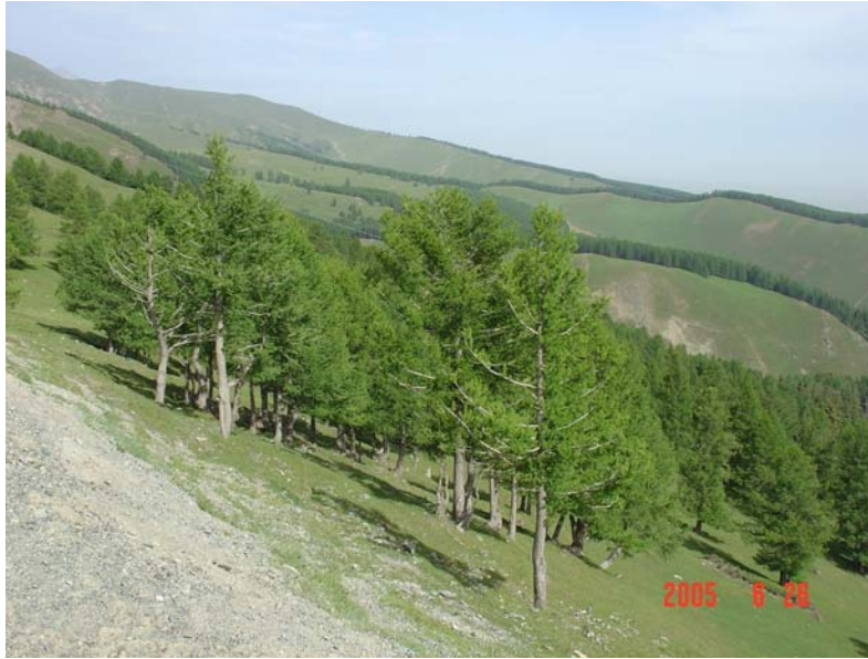
FIGURE 4 Privately operated tourist site in mountain forests south of Shihezi.