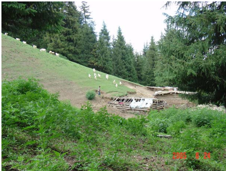
FIGURE 6 Grazing sheep in the forest land in Tianshan mountains.

Unfortunately, these precious forests face many challenges. Firstly, grazing can still not be completely prohibited in the forest land. About one quarter of the forested land is actually sparse forests, where grasses grow well. They have been grazed for many years as traditional pastureland. Since 2000, the Tianshan mountain forests have been listed as logging-banned areas (small volume of timber production is allowed only in the Ili valley) by the national Natural Forest Protection Project (NFPP), but grazing has not been stopped (Figure 6), because the local herdsmen have also lawful land use certificates issued by the local animal husbandry department. Consequently, one piece of land can be lawfully used both by forestry workers and by herdsmen. As a result, forests on these mountain slopes are undergoing degradation, generally from sparse forest land to actual grassland.