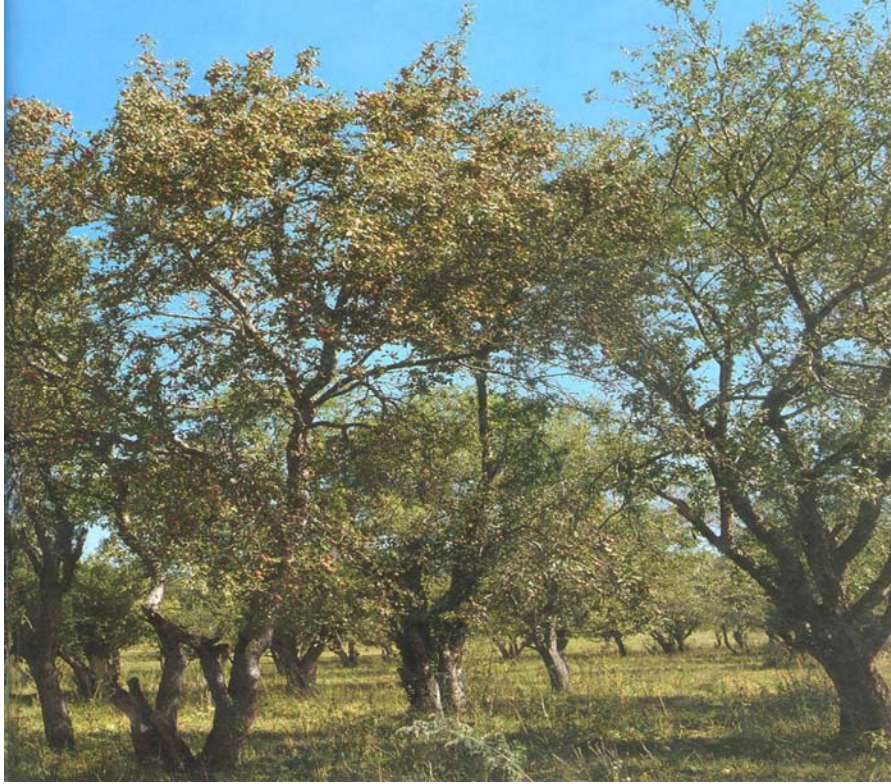
FIGURE 3. Wild apple forest in the Ili river valley