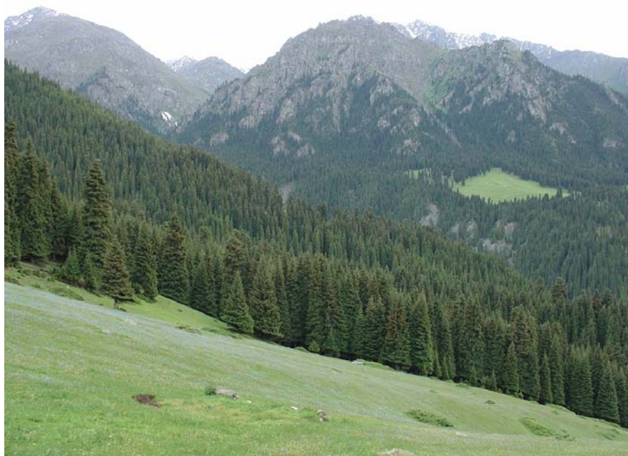
FIGURE 2 Montane forests in the northern flank of the Tianshan, with the symbolic species, Schrenk spruce.

The most outstanding feature of the Tianshan Range in Xinjiang is the existence of a “green forest belt” on shady (northern) slopes of the middle mountains in the northern flank. Its existence is closely related with a rich rainfall belt (above 500 mm) and a temperature inversion layer in winter in the middle mountains. And the forest is characterized by a single species (Figure 2), mainly Schrenk spruce ( Picea schrenkiana Fisch. Et Mey), with some deciduous forests in the Ili Valley in the west and some larch forests in the easternmost section (Figure 3).